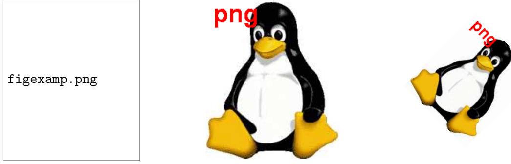
Figure 1 – same figure with draft option (left), normal (center) and rotated (right)